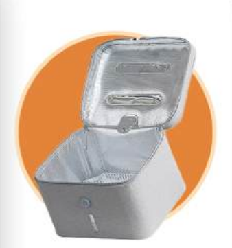
Shop & enjoy free extra's